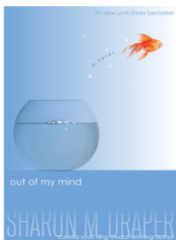
Out of My Mind by Sharon Draper