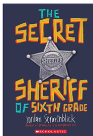
The Secret Sheriff of Sixth Grade by Jordan Sonnenblick

Read ONE of the novels shown below this summer.